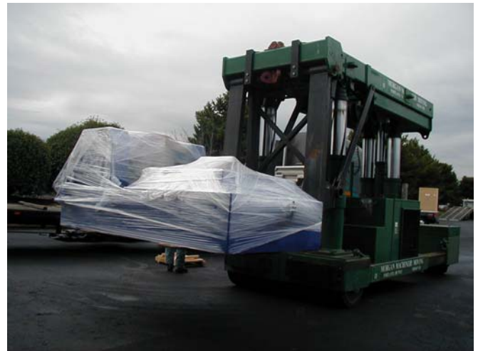
It took a 50,000 lb FORKLIFT to unload our new 27,000 lb VIBRATION TEST SYSTEM!

Cascade TEK is pleased to announce the arrival of our new heavy duty vibration test system. We can now perform the most rigorous shock and vibration profiles on all types of products, even very heavy or large test articles. The system offers over 12,000 force pounds of sine and random vibration with 2" stroke! The addition of this new system DOUBLES our CAPACITY. See how quickly we can schedule and complete your next test program.