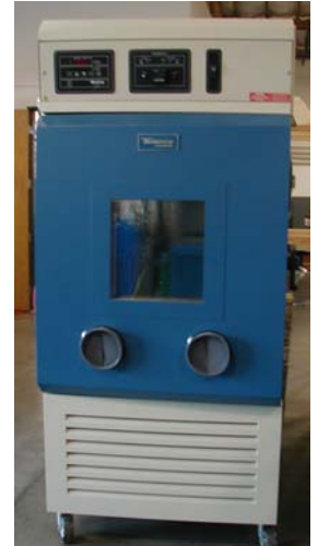
Temp + Humidity -35C to +177C Tenney Model T20RS

Our surplus inventory is full of gently used & completely reconditioned environmental test chambers looking for a lab of their own. Cascade TEK performs all the reconditioning & upgrades in-house to insure equipment meets your performance requirements. Cascade TEK can assist with Start up and Training on any test chamber. Ask Mary (mary@cascadetek.com) if we have a chamber that will fit your needs.